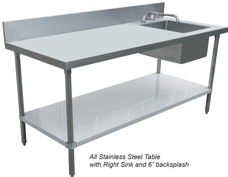
All Stainless Steel Table with Right Sink and 6" backsplash